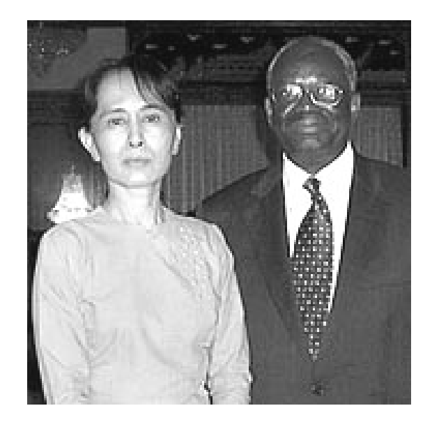
Gambari and Aung San Suu Kyi on September 30, 2007

After the visit, the junta's leader Than Shwe said on TV that he was willing to meet Aung San Suu Kyi personally but under the condition that she abandoned her calls for "confrontation, utter devastation, economic sanctions and all other sanctions."<sup>443</sup> On October 8, on Gambari's recommendation to appoint a liasion officer for relations with Aung San Suu Kyi a "Minister for Relations" was appointed. On October 25, the first meeting took place and was reported in the state media.<sup>444</sup>